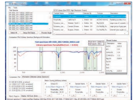
Pyrophyllite spectra identified with EZ-ID.