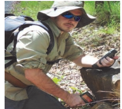
oreXpress with EZ-ID for identifying and mapping alteration zones.

With the oreXpress, oreXplorer or oreXpert and EZ-ID, your target mineral can be matched against known mineral spectra in three libraries: the USGS, SPECMin and GeoSPEC mineral libraries. Adding match regions to your scans can help you focus on the most important absorption features for identifying minerals in mixtures. For example you can focus on alunite's key features at 1440,1475,1760,2165/2206 and 2320nm; pyrophyllite at 1396,2066/2078, 2168 and 2320nm; kaolinite at 960,1400/1412,2160/2206,2310,2350 and 2380nm; illite at 1410, 2215 and 2340nm; chlorite at 2260 and 2355nm.